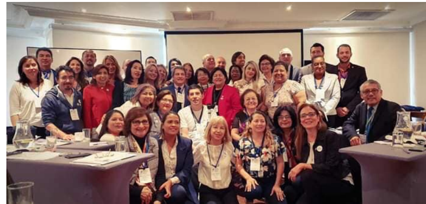
Group of expert patients and authors

The information gathering technique was the so-called citizen jury, which involved the participation of 30 leaders of patient organizations in 13 countries evaluating the needs and preferences of patients with RMDs, as well as experts in the scientific area. The analysis process followed three phases: coding, description, and identification.